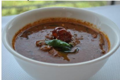
South Indian fish curry