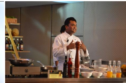
Kotak bank Event-Demo