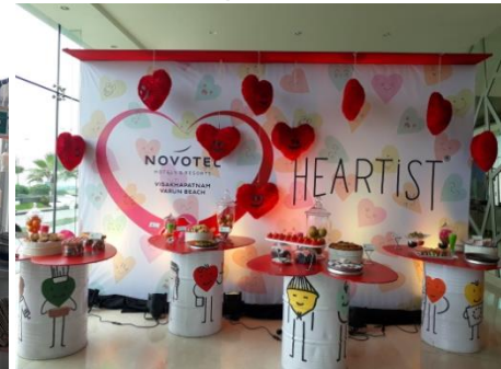
Heartist themed based Hi-Tea