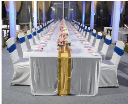
Sit down Lunch – Corporate