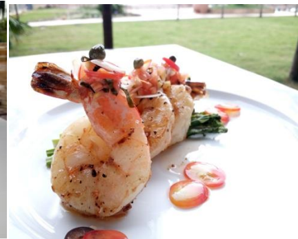
Prawn with Beurre noisette